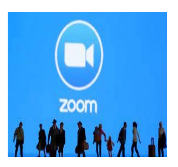
Click here to download Zoom https://zoom.us/

711 St. Paul Street Baltimore, Maryland 21202